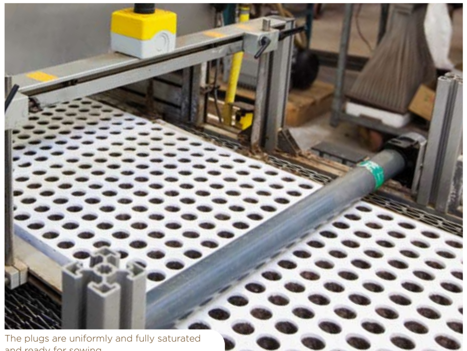
The plugs are uniformly and fully saturated and ready for sowing.