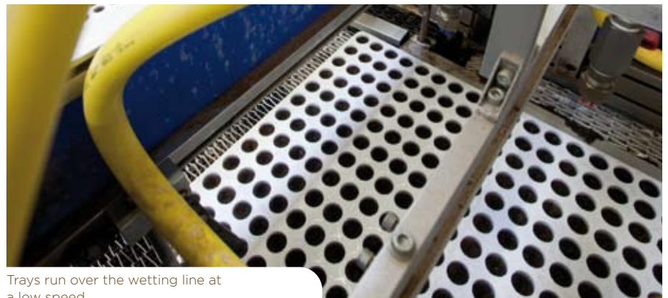
Trays run over the wetting line at a low speed.