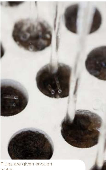
Plugs are given enough water.